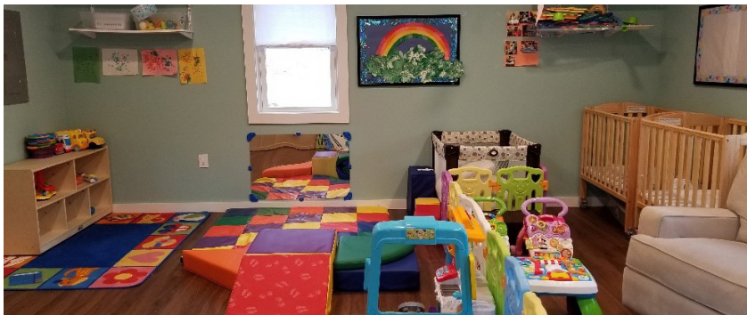
PHOTOS: RENOVATIONS AT BABY STEPS CHILD CARE, PROCTOR, VT

“By working together, we can hold each other accountable, address challenges, build on successes, dream and inspire.”