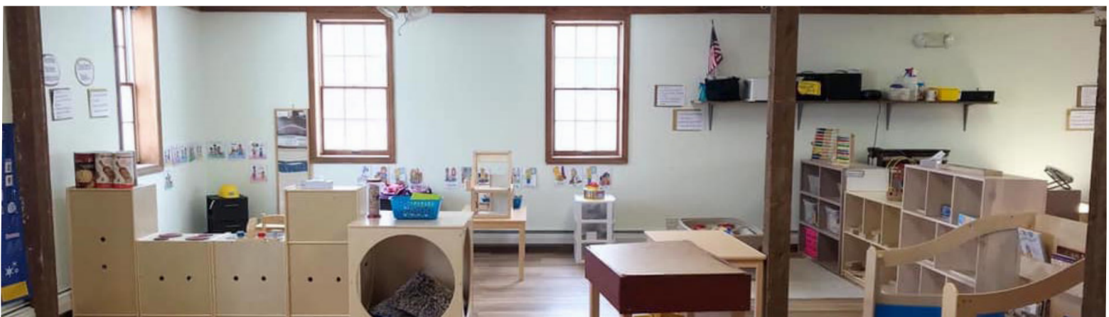
PHOTO: COMPLETED REPAIRS AND RENOVATIONS AT THE RUTLAND COUNTY PARENT CHILD CENTER, RUTLAND, VT

READ FULL REPORTS ON CHILD CARE ACCESS AND AVAILABILITY, PLUS WORKFORCE DEMAND, AT: